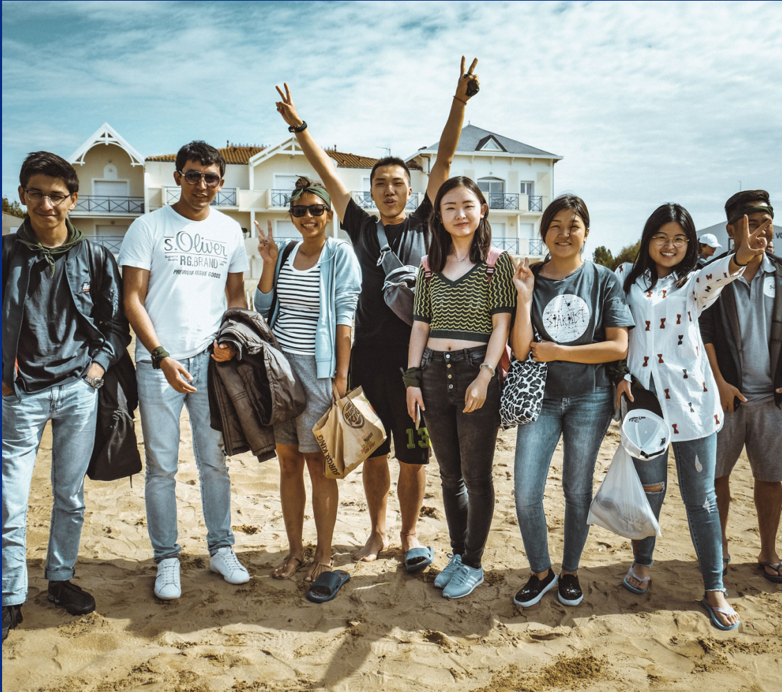
Design: Excelia - Photos: Florent Garcia, Laurinda Hudgens, Adobe Stock All rights reserved - 03/2024 - This document is non-contractual. The Management reserves the right to modify content and dates.